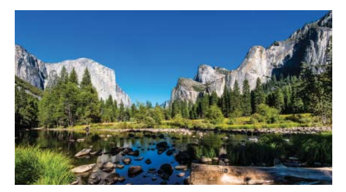
Yosemite National Park

In this semiannual report, I am pleased to submit a summary highlighting the Office of Inspector General's dedicated and successful work covering the 6-month period from April 1, 2013, through September 30, 2013. Our audit and investigative work focused on high priority areas, such as energy, climate change, public safety, and theft of Government funds, to promote excellence, integrity, and accountability within the programs, operations, and management of the U.S. Department of the Interior.