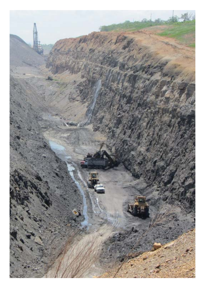
An active mine site and equipment at the Liberty 6 mining site in Oklahoma.

OIG visited 8 of the approximately 60 "inspectable" mining units in Oklahoma. We observed mines in various states of reclamation, restoration, and abandonment and learned that coal-mining companies were not restoring lands after mining, sometimes leaving behind large, dangerous holes that prevented landowners from using the lands for their original purposes. Some of the mines appeared to have been abandoned, while others did not meet reclamation standards.